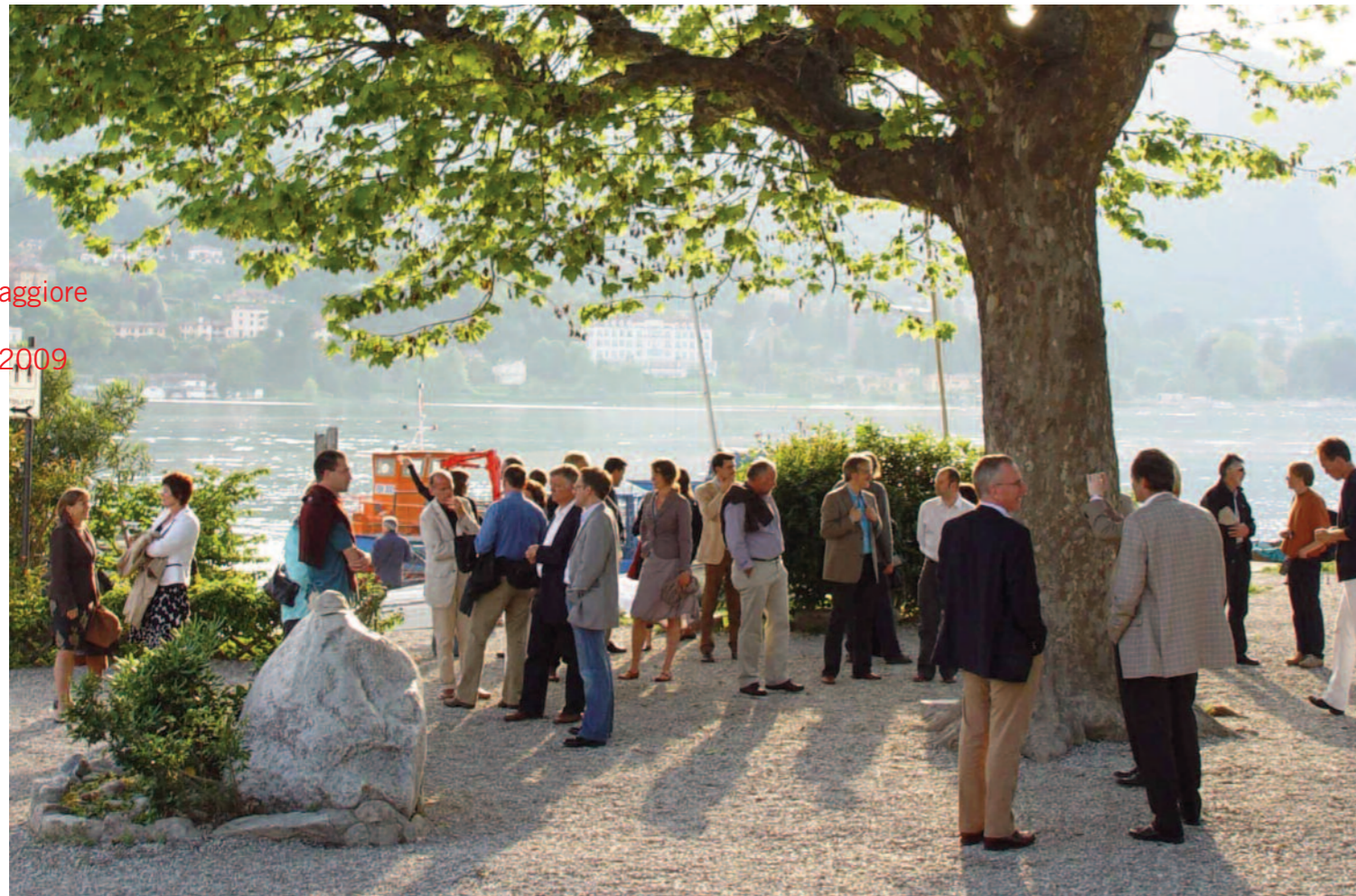
The landscape setting for the seminar on the shore of Lago Maggiore was chosen deliberately. The sense of the evident importance of the landscape was reinforced by the ambience and a meal featuring excellent local products.